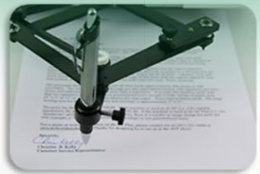
Machine Signing Services