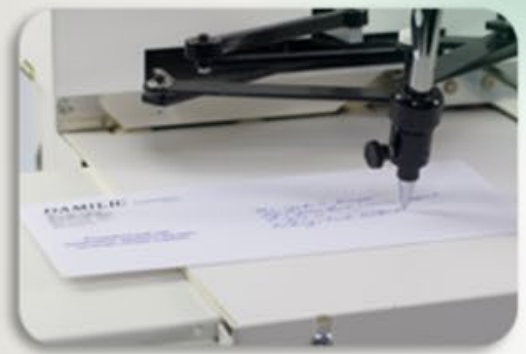
Envelope Addressing and Personalized Message Service